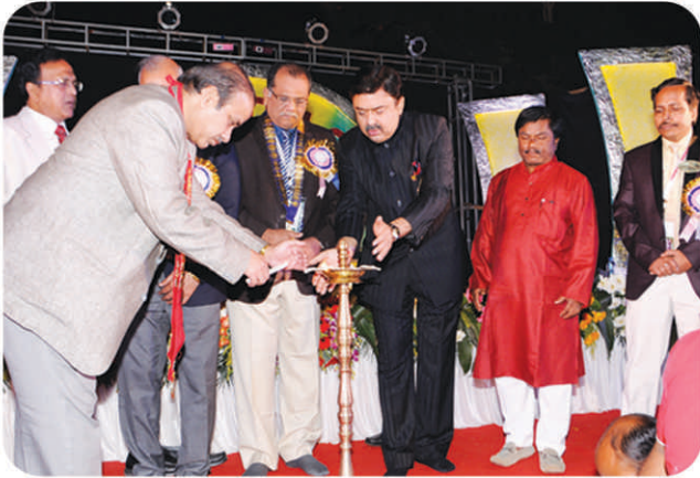
LIGHTING OF THE LAMP AT THE 30 TH OSASICON AT CUTTACK CLUB