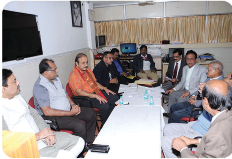
VENUE : SHANTI MEMORIAL HOSPITAL PVT. LTD