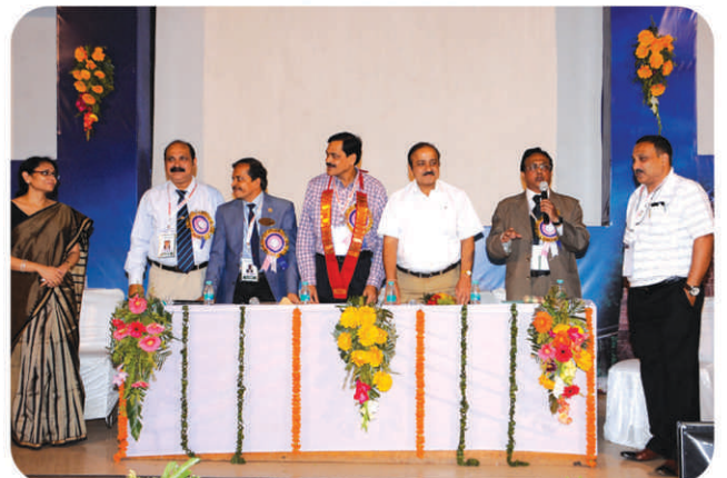
CLOSING REMARKS AT THE END OF VALEDICTORY FUNCTION