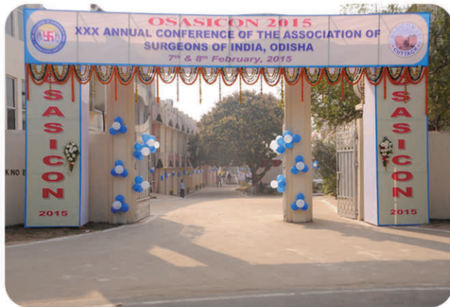
OSASICON – 2015 VENUE: BIJU PATNAIK FILM & TV INSTITUTE