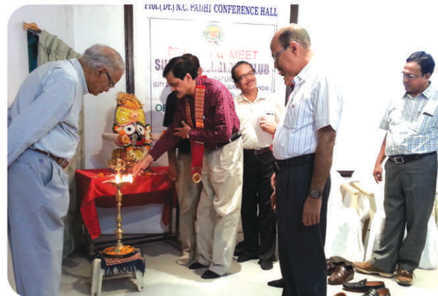
LIGHTENING OF THE LAMP OF CME AT BERHAMPUR