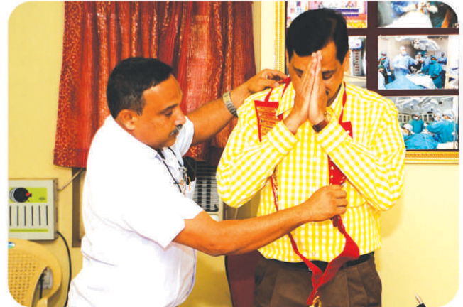
GARLANDING OF NEW PRESIDENT BY HON.SECY