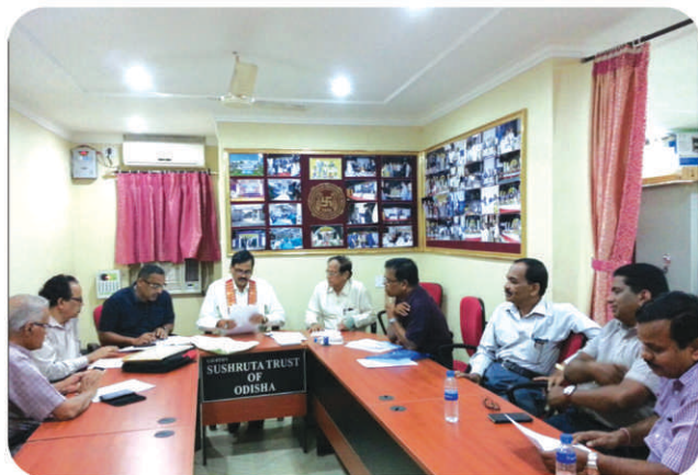
2 nd EC MEETING IN PROGRESS ASI, ODISHA CHAPTER