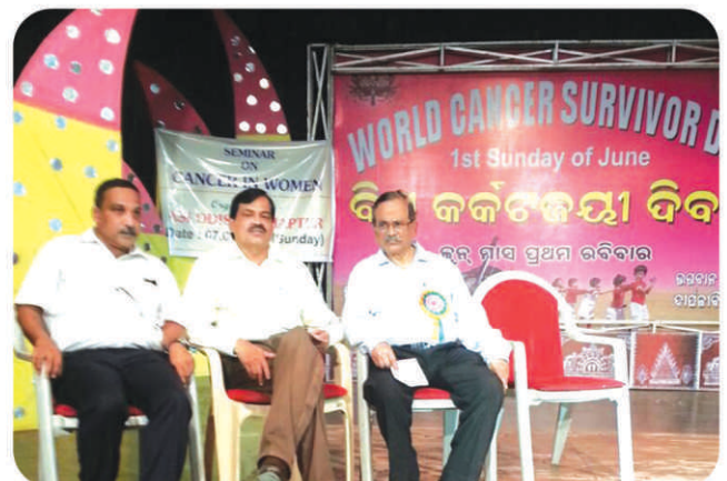
WORLD CANCER SURVIVOR DAY 1 st JUNE 2015, CUTTACK