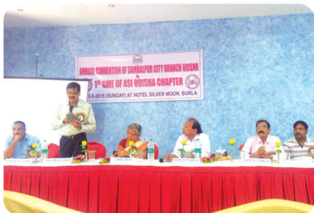
ANNUAL CONVENTION OF SAMBALPUR CITY BRANCH 1 st CME OF ASI ODISHA CHAPTER, BURLA