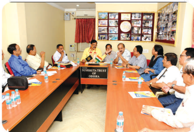
1 st EC MEETING IN PROGRESS ASI, ODISHA CHAPTER