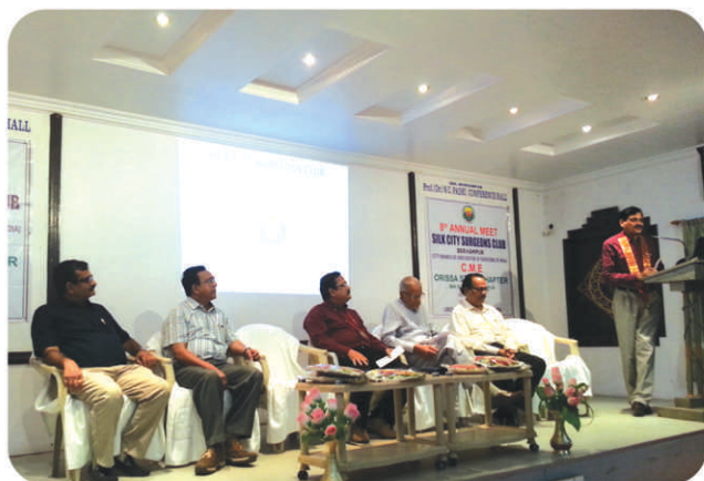
CME AT BERHAMPUR