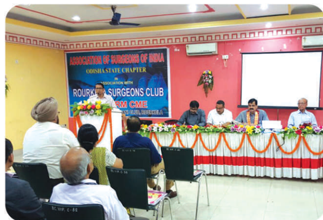
CME AT ROURKELA