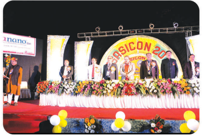
CLOSING OF THE 30 th OSASICON INAUGURATION WITH THE NATIONAL ANTHEM