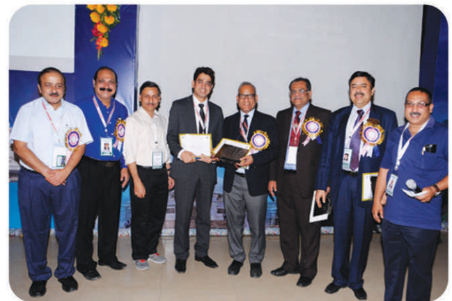
CHAIRPERSONS AND INVITED FACULTY AT THE SCIENTIFIC MEET AT OSASICON 2015