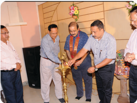
Lightening of the Lamp of PG Instructional Course