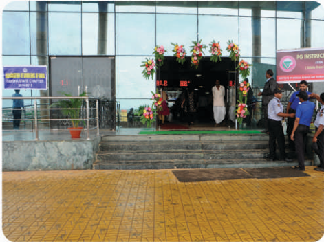
SUM Hospital, BBSR Entrance