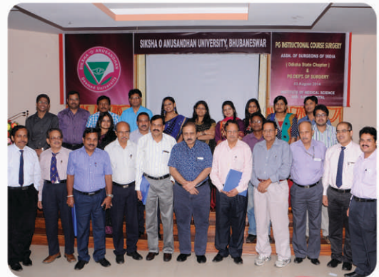
Group Photo at the PG Instructional Course at SUM Hospital