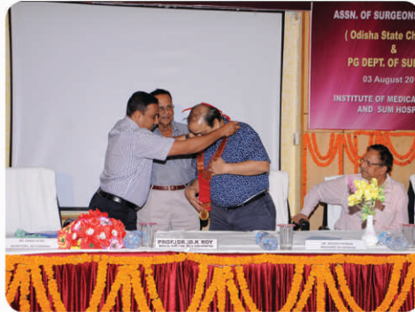
Garlanding of President by Hon.Secy