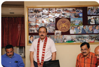
Garlanding of the medallion