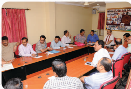
EC meeting in progress