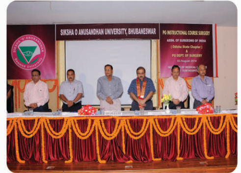
SUM Hospital Anthem in Progress